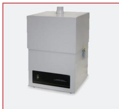
AIR FILTER UNIT

Compact industrial filter unit with triple filtration